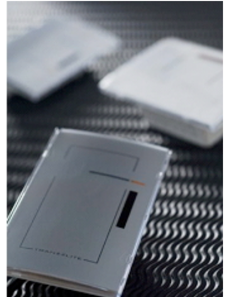
TS-TI01 / TS-TIA01 (1 Gang)